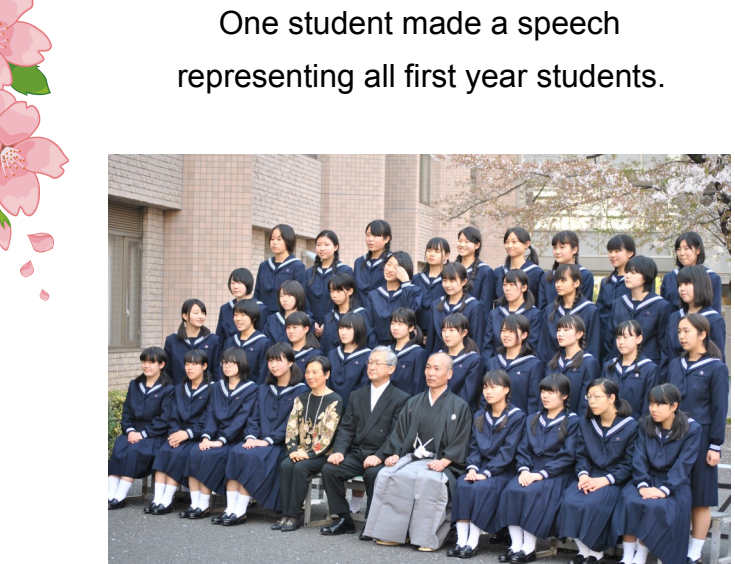
There are 8 first year classes.